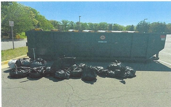
Dozens of bags of trash and junk were collected from public grounds and neighborhood streets. The material was hauled away by Fairfax County on the day of the clean-up.

Volunteers collected litter, cleared debris, and helped restore these important gathering spaces for students, families, and residents to enjoy. Their dedication reflects the strong community spirit that continues to define Hillbrook-Tall Oaks