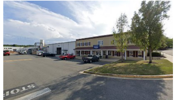
Smoot Lumber on Edsall Road, now closed.

The plan to build a data center on the 34-acre "Plaza 500" industrial site on Edsall is being met with protests from residential neighbors. The property is located on the eastern edge of Fairfax County adjacent to the Bren Pointe community. The data center is surrounded residential properties, whose owners are concerned about nonstop noise associated with that data center's operation—caused by 24-7 cooling fans and intermittent backup diesel power generators. This would be the only large-scale data center located inside the beltway in Virginia.