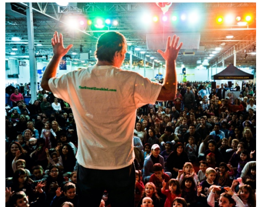
The Great Zucchini