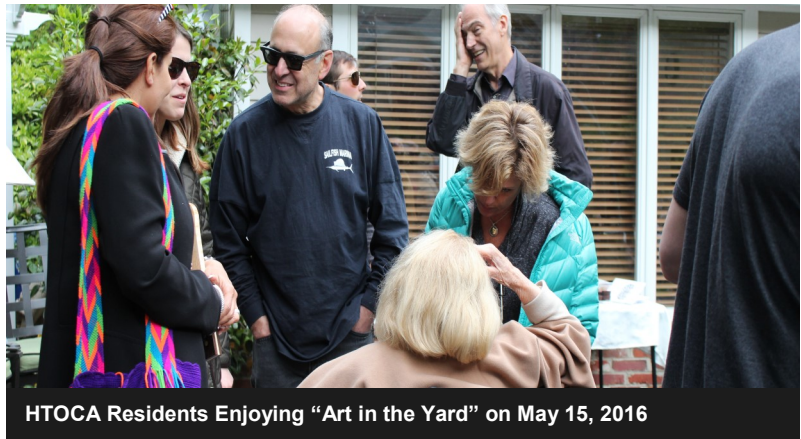
HTOCA Residents Enjoying "Art in the Yard" on May 15, 2016