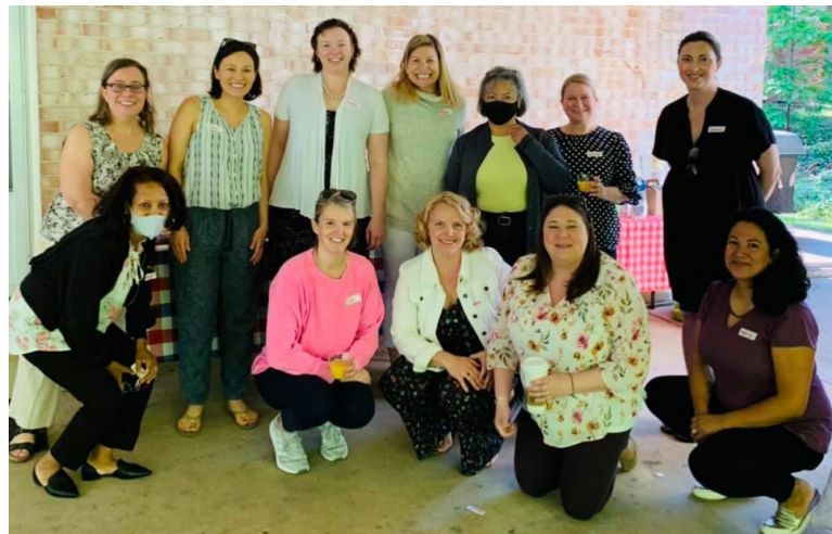
Women's Wellness Group Appreciation Brunch